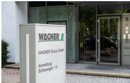
Caption: Successful financial year for the WAGNER Group GmbH

According to him, the outstanding commitment of the employees plays a major role in the company's success: "The exceptionally good overall performance and successful development of our group would not have been possible without the daily commitment of our motivated employees at headquarters and in the subsidiaries. In addition to thanking our customers and business partners, the management would especially like to thank our #teamWAGNER."