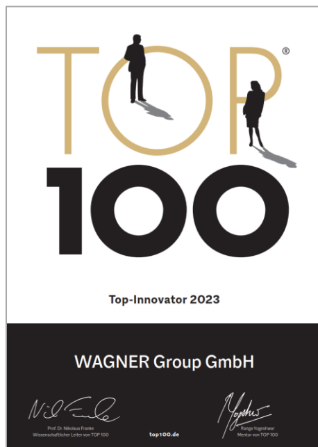
Caption: The certificate honors WAGNER Group GmbH as Top Innovator 2023.