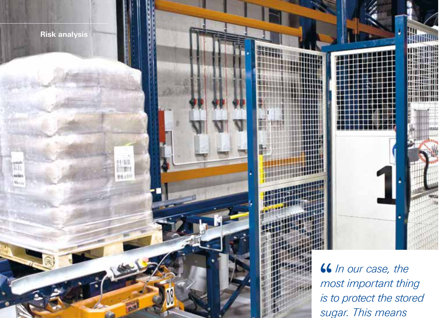
▲ Packed on pallets, sugar products are stored in the 35m high automated highbay warehouse for dispatch.

“ In our case, the most important thing is to protect the stored sugar. This means foam or water-based solutions were not an option for us. ”